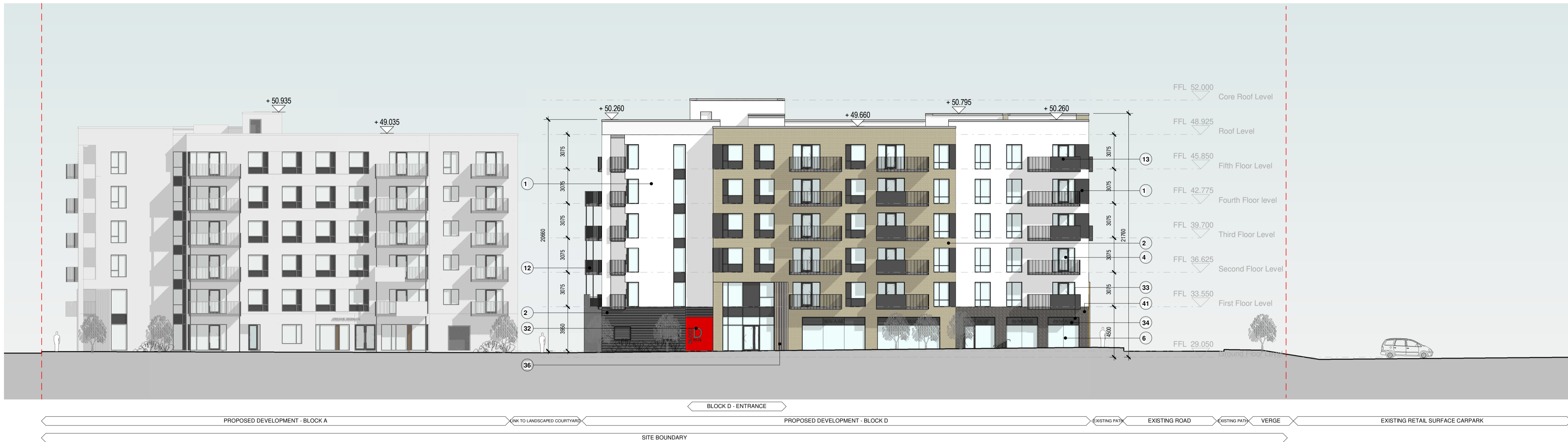
3 BLOCK D - NORTH FACADE ALONG PROPOSED LINK ROAD 1 : 200