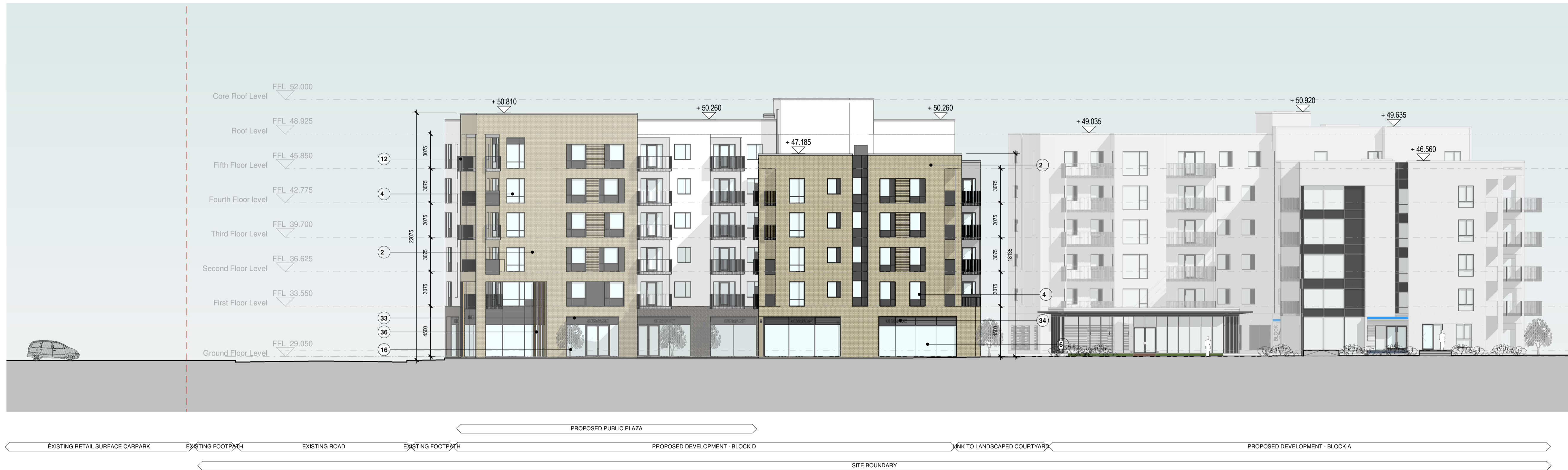
4 BLOCK D - SOUTH FACADE ALONG PROPOSED PEDESTRIAN LINK 1 : 200